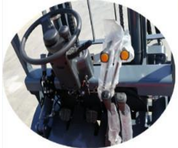
Operating Steering wheel and function operation bar Enlarge working space