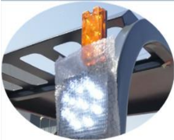
Full set of LED light Save electricity, high strength, longer service life.