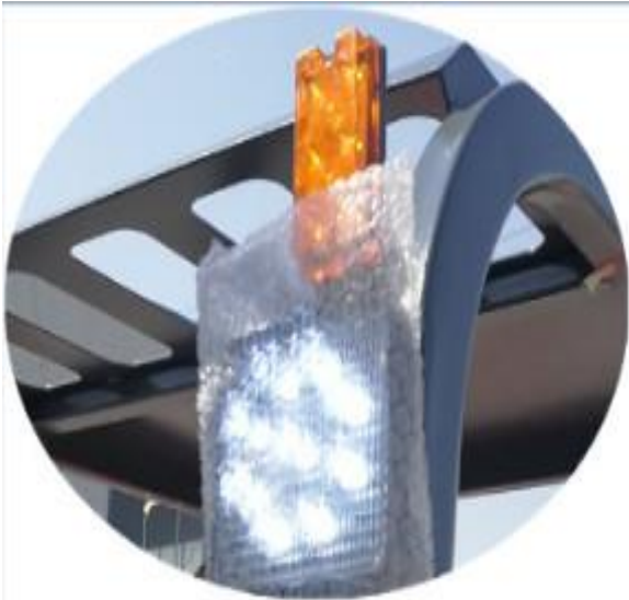
Full set of LED light Save electricity, high strength, longer service life.