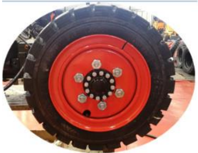
Wear-resistant solid tire Increase the ability of forklift to adopt different roads and working environment.