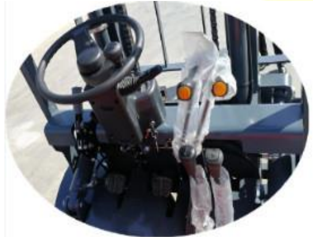
Operating Steering wheel and function operation bar Enlarge working space