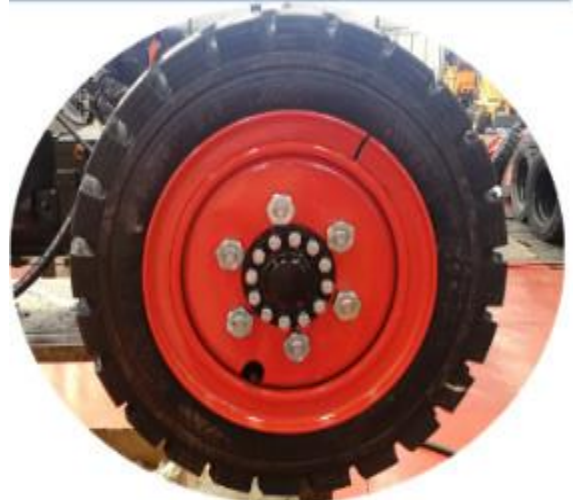
Wear-resistant solid tire Increase the ability of forklift to adopt different roads and working environment.