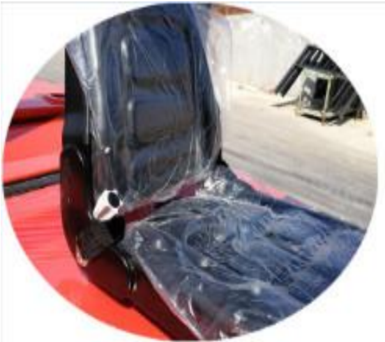
New suspension adjustable seat More comfortable when working