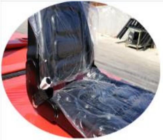
New suspension adjustable seat More comfortable when working